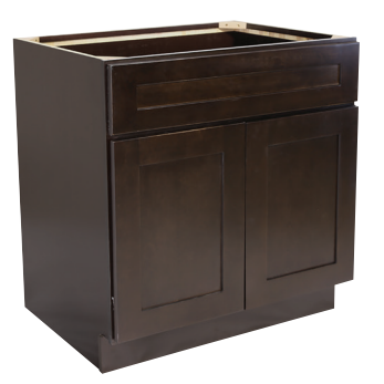
SINK BASE CABINET