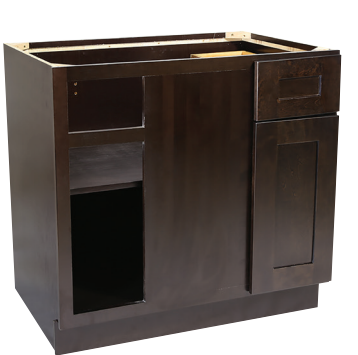
BLIND BASE CABINET Reversible left or right